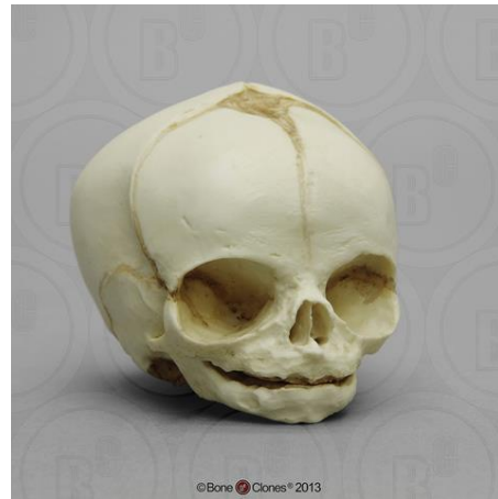
Fetal human skull