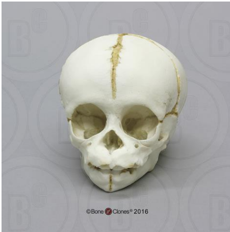
Fetal Chimpanzee skull